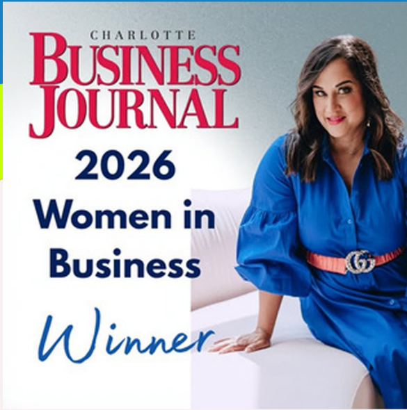
Charlotte Business Journal-Women in Business Award - 2026