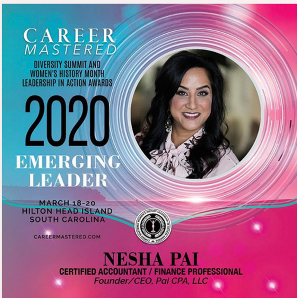
Career Mastered Magazine Emerging Leader Award - 2020