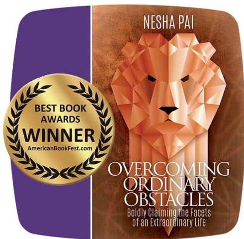
Multicultural Non-Fiction Award - 2020 American Book Fest