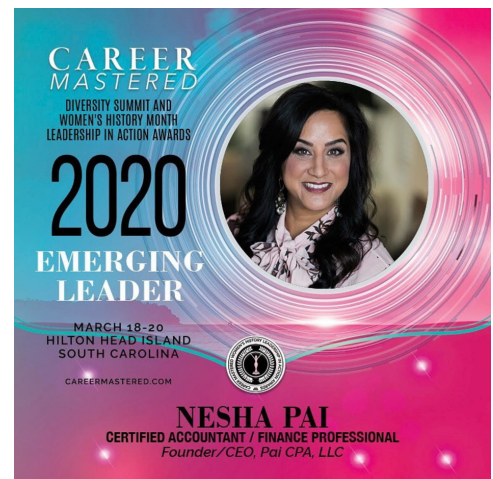
Career Mastered Magazine Emerging Leader Award - 2020