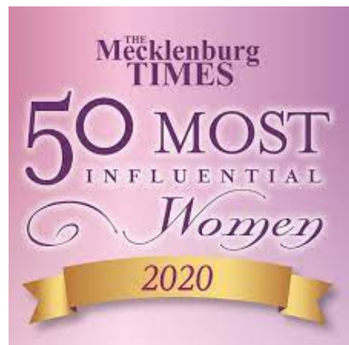
The Mecklenburg Times 50 Most Influential Women - 2020